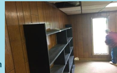
Timber Ridge before the renovation

➤ October 26 th : Timber Ridge and ESD 159 Opens Community Resource Center